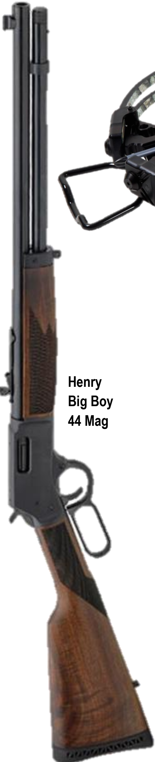
Henry Big Boy 44 Mag

Benefits Marine Corps League Programs and the 1/24 Memorial