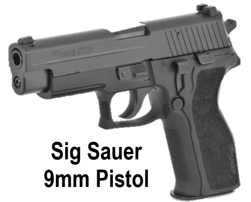
Sig Sauer 9mm Pistol