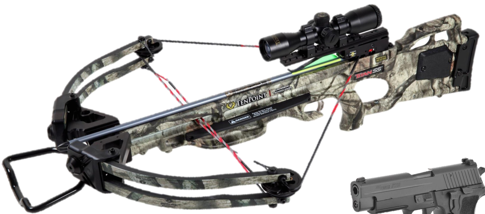
Tenpoint Titan SS™ Crossbow